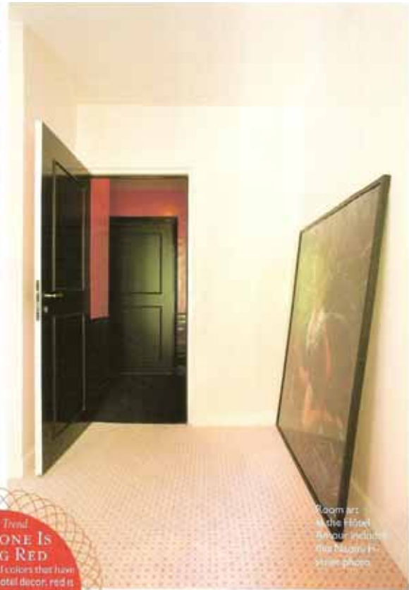
Room art in the Hôtel d'Amour includes the Nuoro F. Sironi photo.