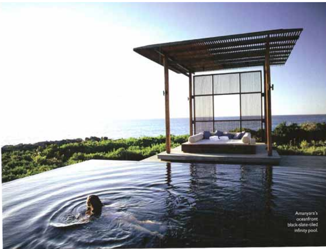
Amanyara's oceanfront black-slate-tiled infinity pool.