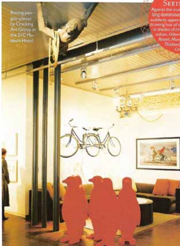
Rowing penguin pieces by Cracking Art Group at the 21C Museum Hotel.