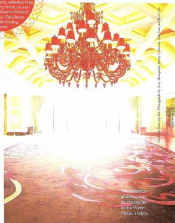
Chandeliers up for bid.