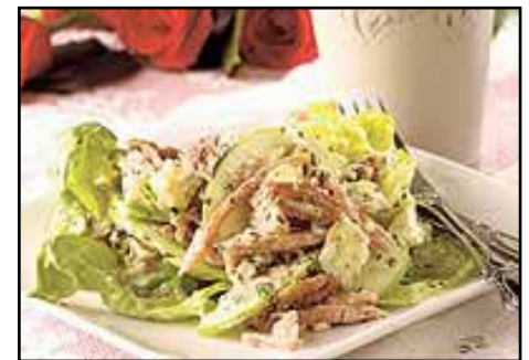
Double-smoked-ham Salad with Apples, Toasted Pecans, Blue Cheese and Bourbon Aioli

▪ In the jar of a blender, combine the shallot, Dijon mustard, lemon juice, vinegar, egg yolk and salt. Blend on high speed and slowly drizzle in the oil to form an emulsified dressing. If the aioli becomes too thick, add a drop of hot water to thin it out.