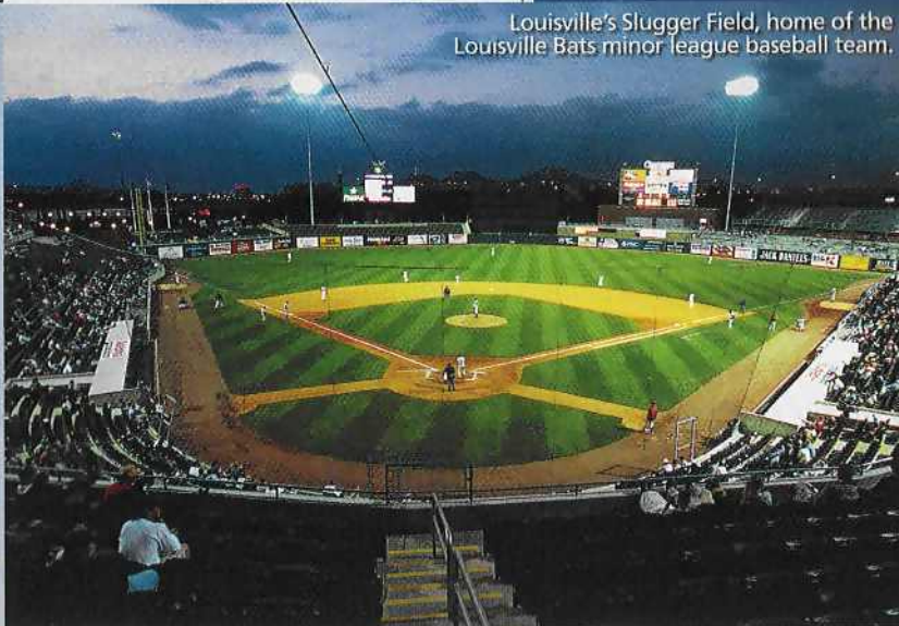
Louisville's Slugger Field, home of the Louisville Bats minor league baseball team.

RUSSELLVILLE —In south-central Kentucky's Logan County, Andrew Jackson fought a duel and the Jesse James gang staged a bold bank robbery. Today, this corner of the state is much more tranquil. In Russellville, the county seat, a walking tour highlights Queen Anne- and Georgian Colonial-style homes and buildings (30 miles southwest of Bowling Green). The 1817 Saddle Factory Museum, believed to be Kentucky's oldest industrial building, features exhibits of early saddles and leather goods (270/726-4181; www.visitlogancounty.com).